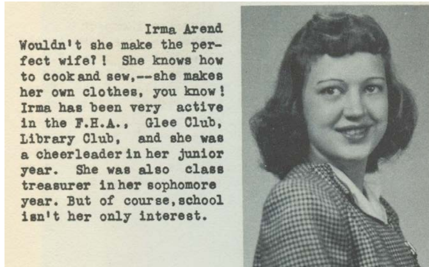
1948 OHS Yearbook Senior Picture