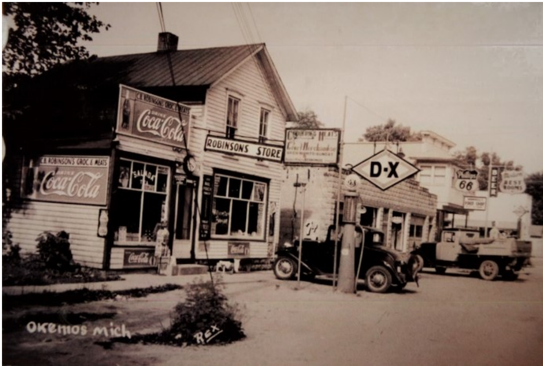
Robinsons Store, circa 1915, Meridian History Museum