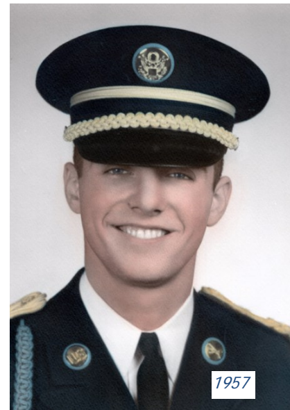
Lansing State Journal, October 16, 1957