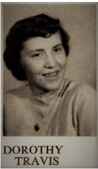
1955 Okemos Tomahawk