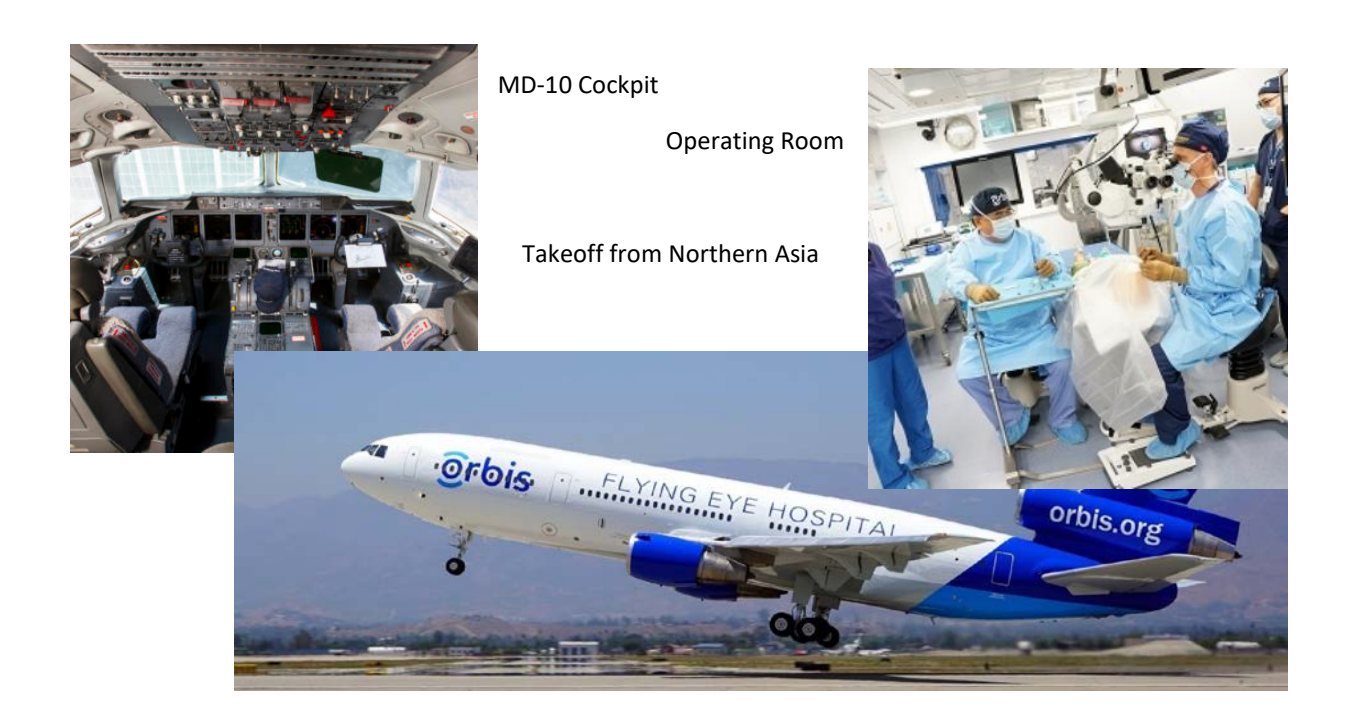
Capt. Harkenen flying the ORBIS Eye Hospital over the world.