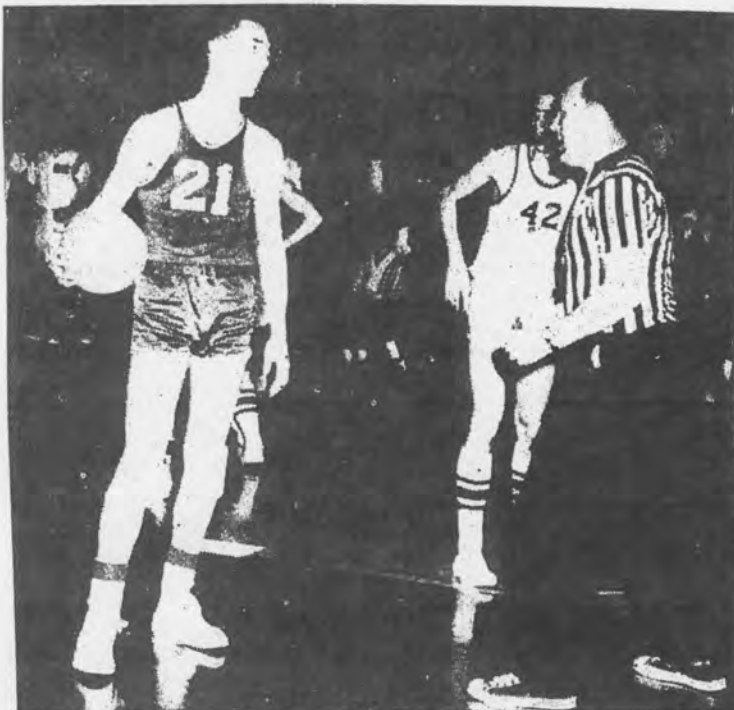
The stripe shirt always wins