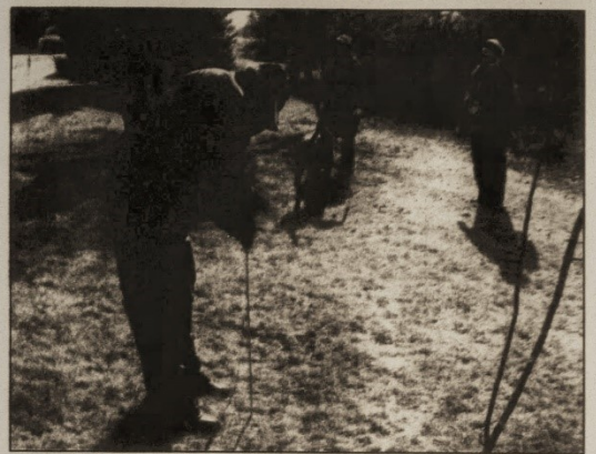
Investigators work in an area near a large tree on private property in Conway Township as cadaver dogs indicate specific locations where human remains may be underground as part of the search for Paige Renkoski.