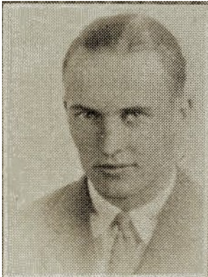
1925 Western State Normal School, Senior Picture