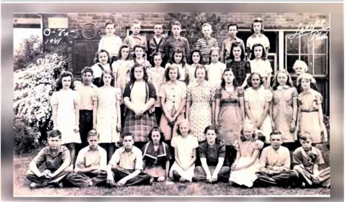
The future Class of 1947, in front of OHS next to the plaque to Chief Okemos. Picture taken in 1941.

The Webb family moved to the Okemos area in about 1937.