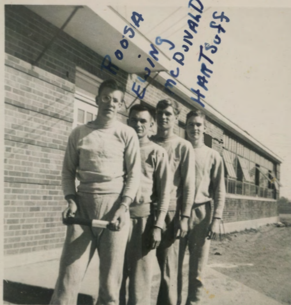
880 yd Relay team (52)