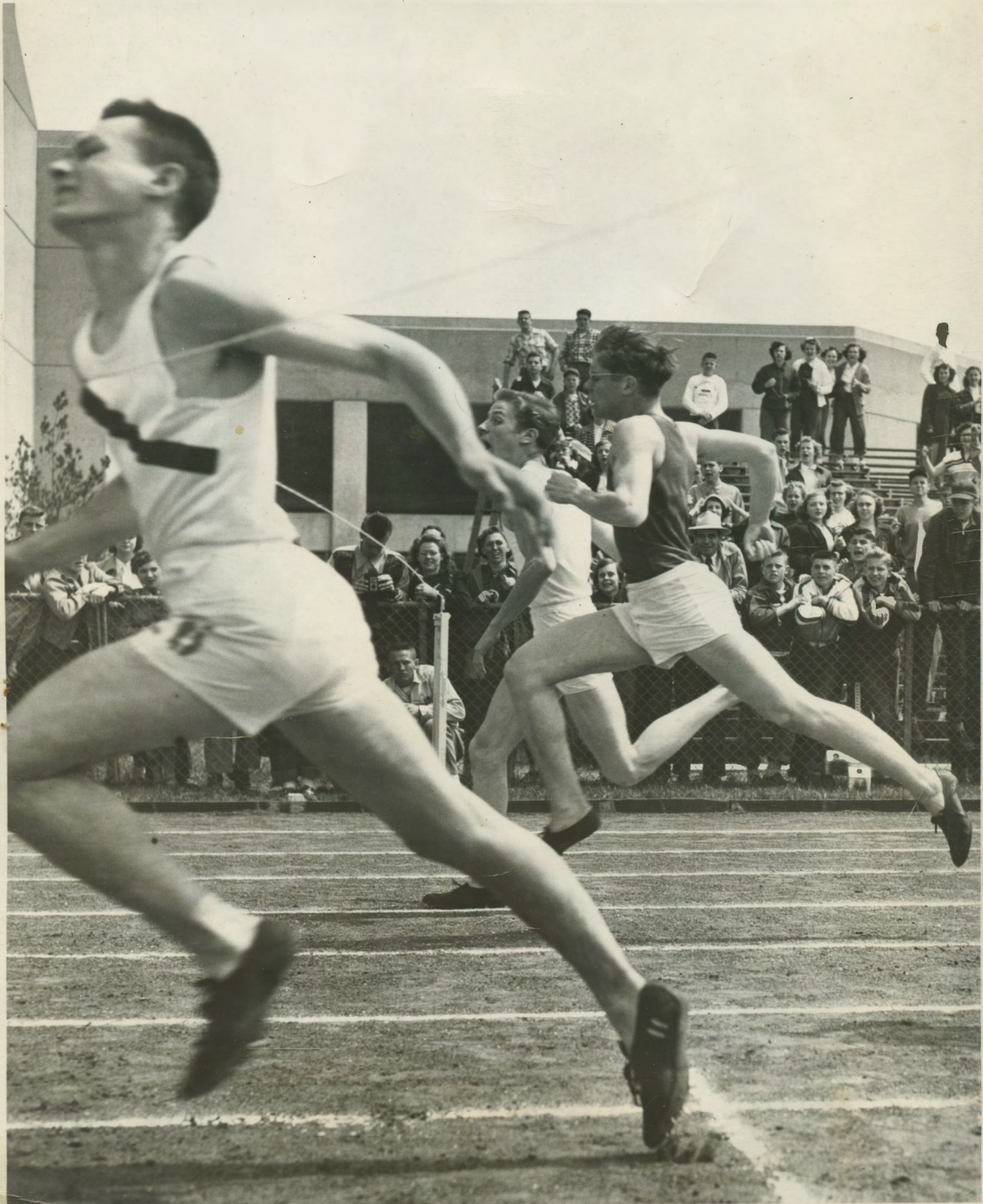
1 ST 100YD DASH — INGHAM COUNTY TRACK MEET — MAY-1951