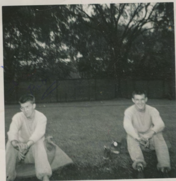
STATE MEET (52)