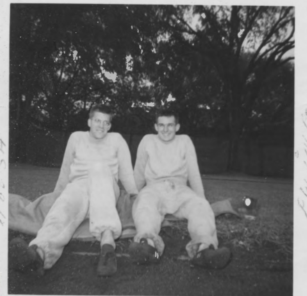
STATE MEET (52)