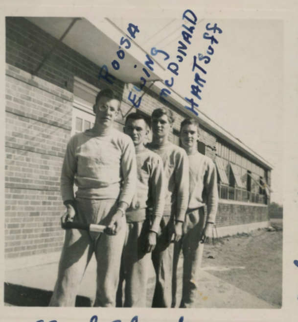
880 yd Relay to (52)