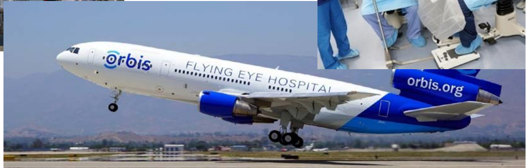
Capt. Harkeney flying the ORBIS Eye Hospital over the world.