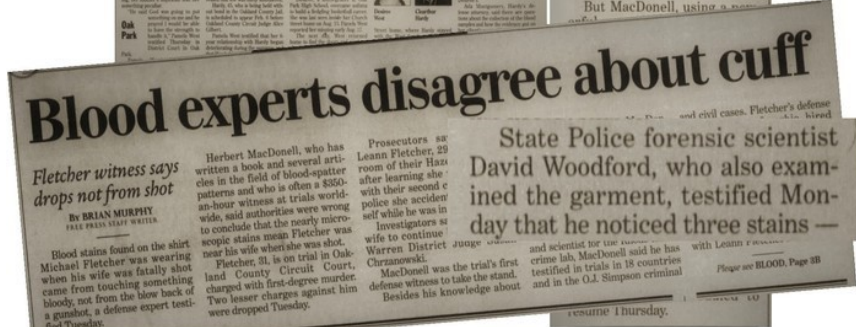
1Detroit Free Press June 21, 2000